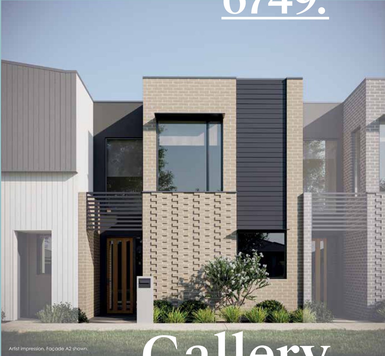
Artist impression. Façade A2 shown.